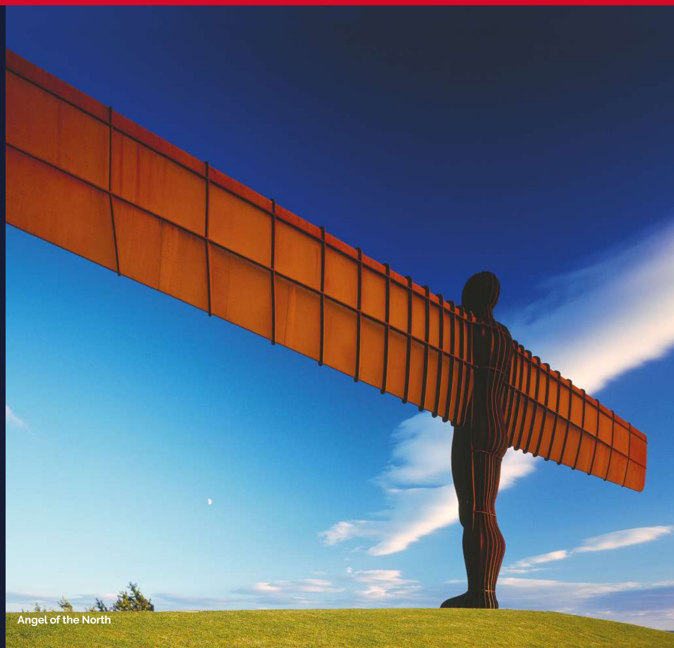
Angel of the North